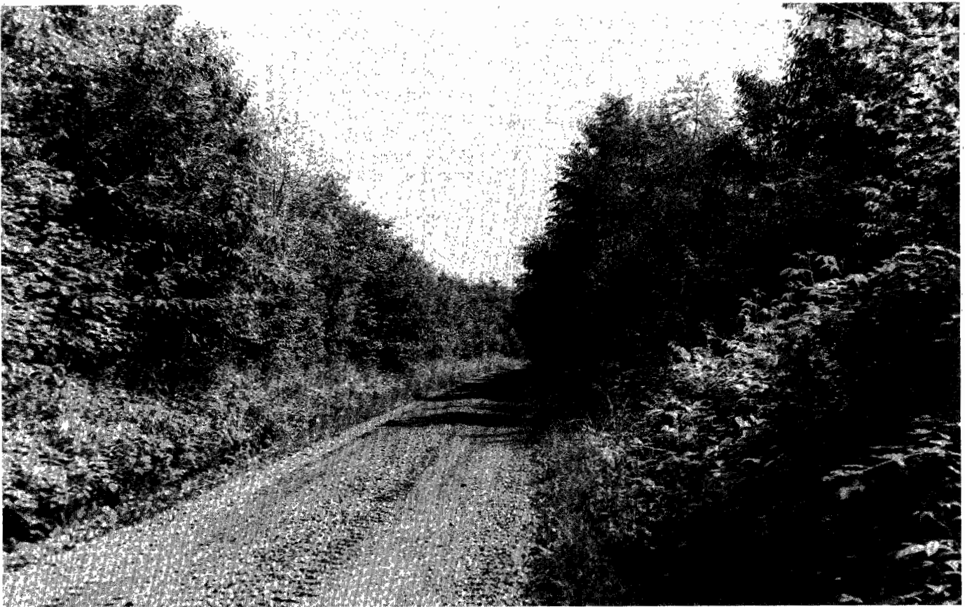
Figure 1A. Study area after clearcutting. B. Seven years later the overstory stems averaged more than 4,000 per acre.